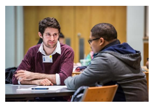
A scholar and coach work together at a Saturday Scholar Development Session at Kennedy-King College in Chicago.

Takeaway 5: Despite their best efforts to build deep relationship with scholars, PCs were concerned about their ability to maintain these deep connections in the face of growing