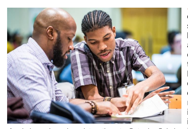
A scholar and coach work together at a Saturday Scholar Development Session at Kennedy-King College in Chicago.

PCs and coaches both helped students with class selection and the transfer process (for example, by helping students identify potential four-year institutions and reviewing scholars' transfer application materials). In addition, PCs and coaches served as "accountability mechanisms" as they consistently checked in with scholars, reminding them about important deadlines and ensuring that they were meeting academic and other program requirements, such as the submission of time-based "deliverables" for the OMD curriculum on leadership, jobs and/or apprenticeships, and graduation and/or transfer. More often, however, PCs took on the additional roles of supplemental academic advisors compared to coaches due to their OMD staff positions. PCs noted that they would strongly appreciate additional training from OMD to best support their scholars when serving in this advising role.